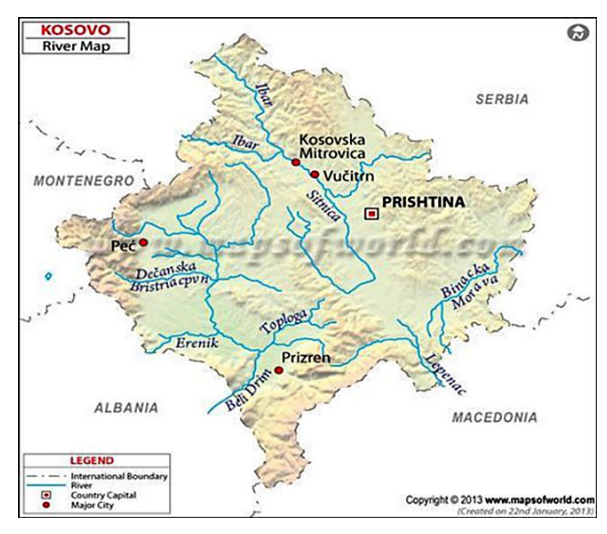
Figure 1. Rivers in Kosovo

The standard methods used for testing various parameters include BS EN, ISO, and EPA methods. The tested parameters include smell, colour, taste, hardness, free chlorine, chlorides, hazy, pH value, conductivity, sulphates, ammonia, nitrites, nitrates, consumption index KMnO_4 ( O_2 ), and various heavy metal concentrations (Zinc, Copper, Cadmium, Lead, Cobalt, Nickel, Sodium,